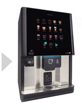
MDB cashless system integration kit

For stand-alone operation, the Vitro S5 MIA allows the inclusion of a cashless system or a separate change giver pod. In addition, it is compatible with the Pay4Vend application that allows payment to be made directly from a mobile phone.