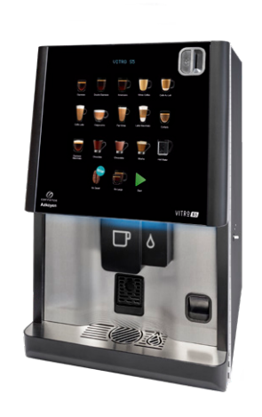
External MDB payment module